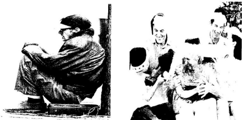
How are you spending your holiday? Don't be selfish give a can, and make a difference

We are 1200 students and our school can make a huge difference if each of us brings in one non-perishable food item.